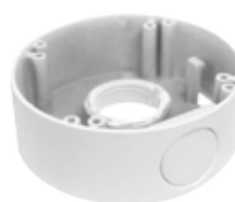
Junction Box AVM-DDMT-W-V1