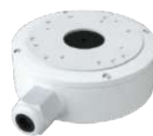
Junction Box AVM-EDMTS-W-TL1