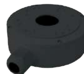
Junction Box AVM-EDMTS-G-TL1